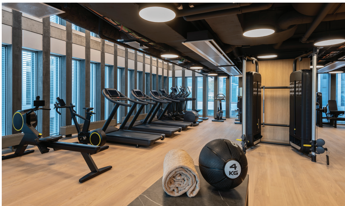
Villapark Oak Avorio in the fitness centre

The Hyatt Regency was opened in April this year as the first of two Hyatt hotels in the new quarter at Zurich Airport. The hotel comprises a total of 255 rooms, including 18 suites, a fitness centre with sauna and relaxation area, and various gastronomic offerings. The rooms, president suite, fitness room, bar and the Regency Club Lounge – these are areas where guests spend most of their time during the stay. The personal well-being as well as the robustness and longevity of the floor are therefore key when it comes to the selection of flooring.