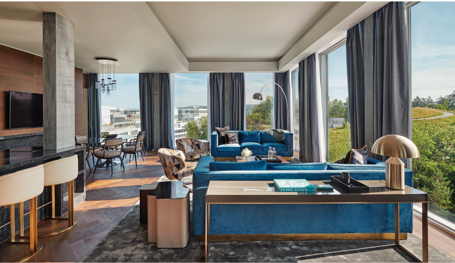
Formpark Quadrato Oak-smoked parquet in the presidential suite @ Hyatt Regency Zürich Airport The Circle

Ntinas elaborated: “The product ranges used from Bauwerk Parkett offers a wide selection of different materials and formats, and thus optimally support our varied colours and material concepts in the Hyatt Regency Zurich Airport The Circle.”